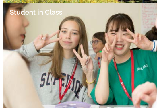
Student in Class