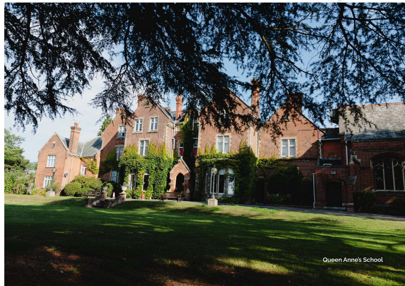
Queen Anne's School

Caversham Walking Tour Oxford with Natural History Museum Reading with Reading Museum Oxford with Pitt Rivers Museum London by train