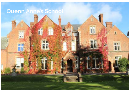
Queen Anne's School

Reading is a large town in the Royal County of Berkshire. It has been important since medieval times, and the ruins of Reading Abbey, a monastery with strong royal connections, can still be visited. The town itself straddles the River Thames and benefits greatly from tourism due to its close proximity to the capital city.