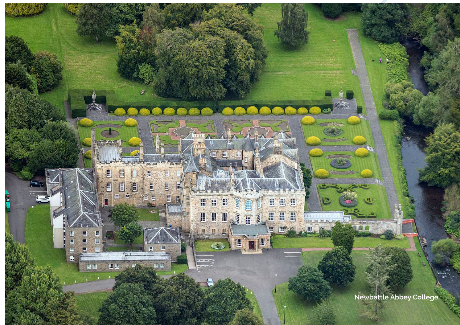
Newbattle Abbey College

Edinburgh Zoo Edinburgh Castle National Museum of Scotland Scottish National Gallery St Giles Cathedral