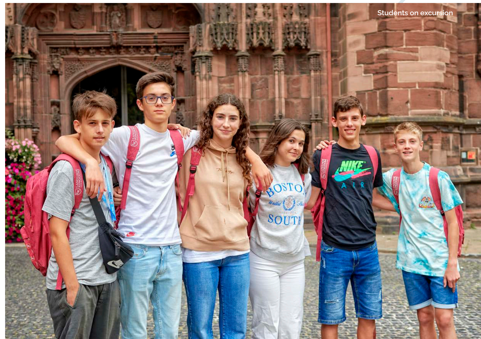
Students on excursion

Excursion Suggestions Chester with City Walls Tour Liverpool with The World Museum and Albert Docks Chester Cathedral