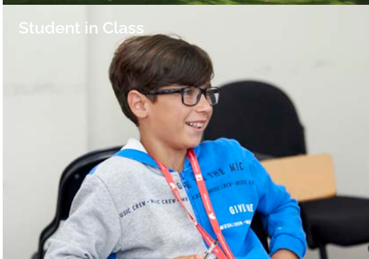
Student in Class