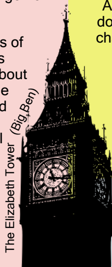
The Elizabeth Tower (Big Ben)

Please note: This is a sample programme and details may be subject to change.