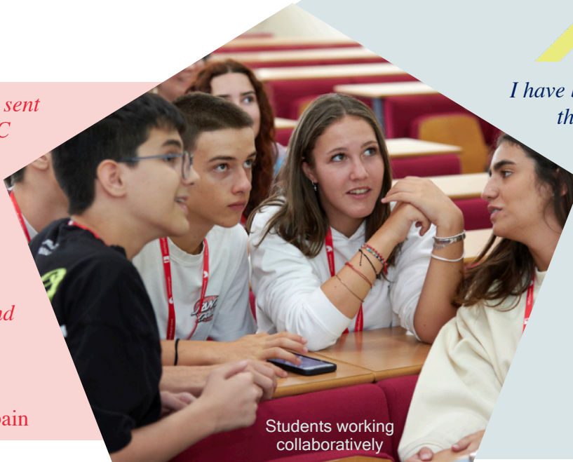
Students working collaboratively

I have been working with UKLC since the beginning because they have always delivered perfect programmes and worked together with us to create new ones on company which is always one step ahead of requests from our clients. It's dynamic and they never lose sight of our clients needs. It's great working together!