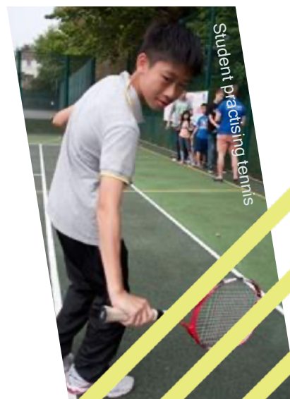
Student practising tennis