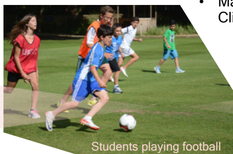
Students playing football