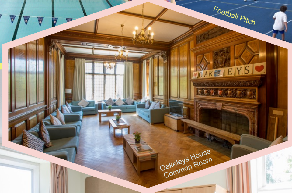
Oakeleys House Common Room