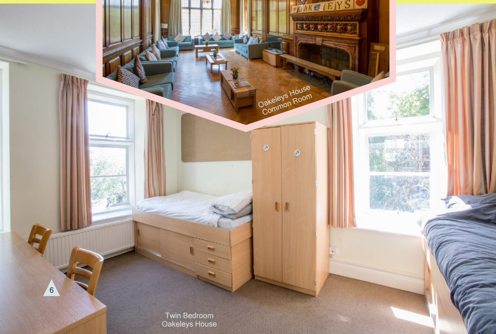
Twin Bedroom Oakeleys House