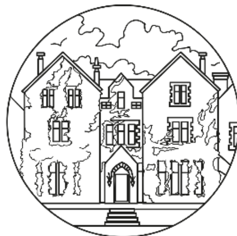
QUEEN ANNE'S SCHOOL

We look forward to a successful summer 2022 at Queen Anne's School.