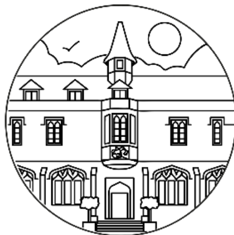
UNIVERSITY OF CHICHESTER

We look forward to a successful summer 2022 at University of Chichester.