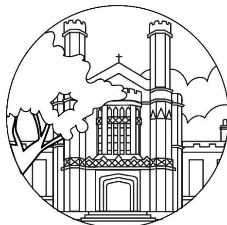
YORK, ST PETER'S SCHOOL

We look forward to a successful summer 2022 at St Peter's School.