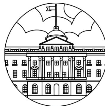
LONDON, QUEEN MARY UNIVERSITY

We look forward to a successful summer 2022 at Queen Mary University, London!